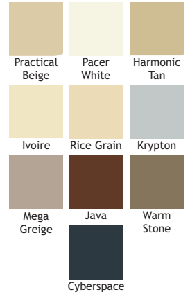
Understated Elegance Color Palette